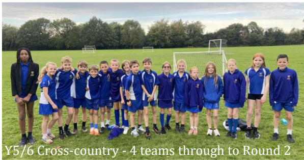
Y5/6 Cross-country - 4 teams through to Round 2