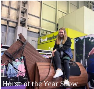
Horse of the Year Show