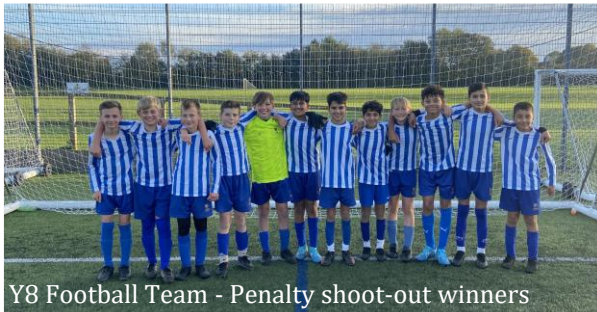
Y8 Football Team - Penalty shoot-out winners