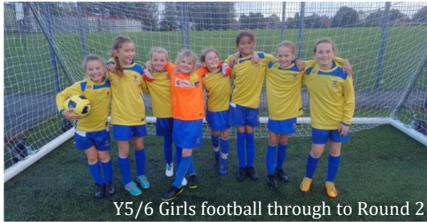
Y5/6 Girls football through to Round 2