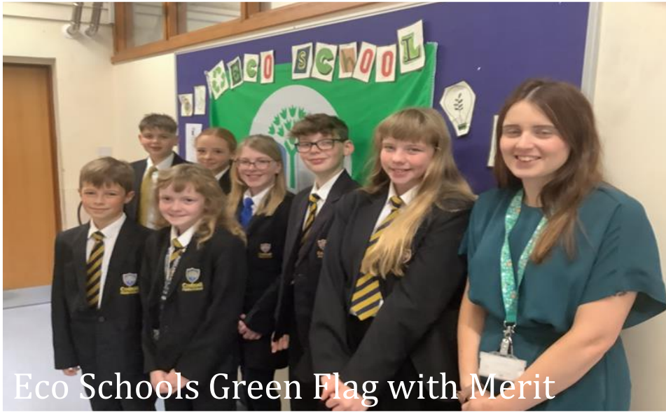
Eco Schools Green Flag with Merit