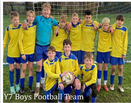
Y7 Boys Football Team