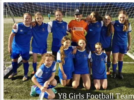
Y8 Girls Football Team