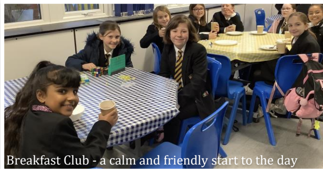
Breakfast Club - a calm and friendly start to the day