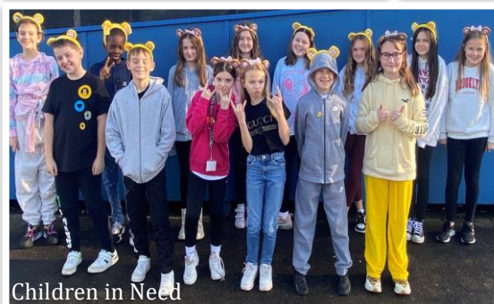
Children in Need