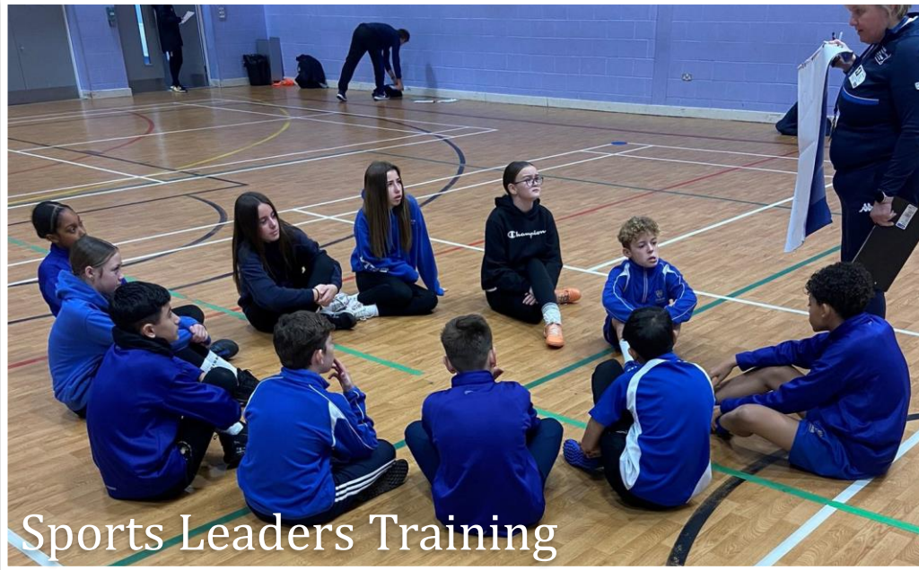
Sports Leaders Training