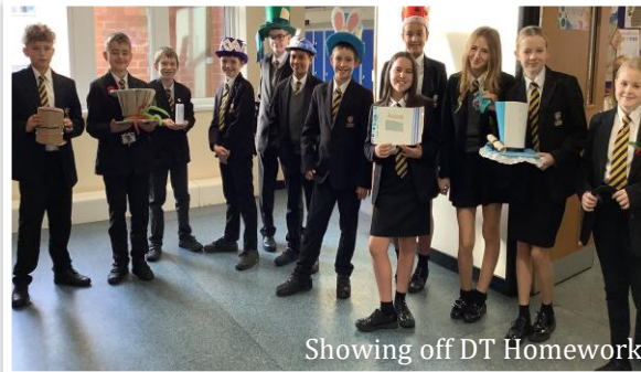
Showing off DT Homework