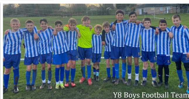
Y8 Boys Football Team